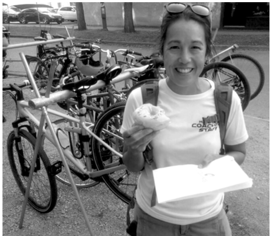
Mobile Feast