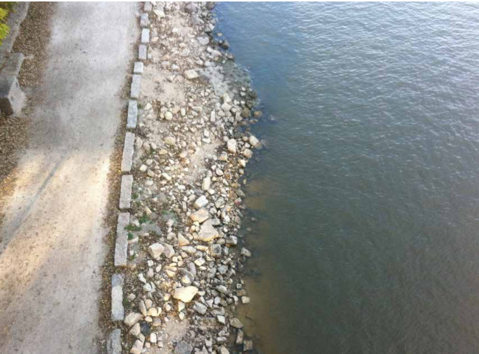
River Walk