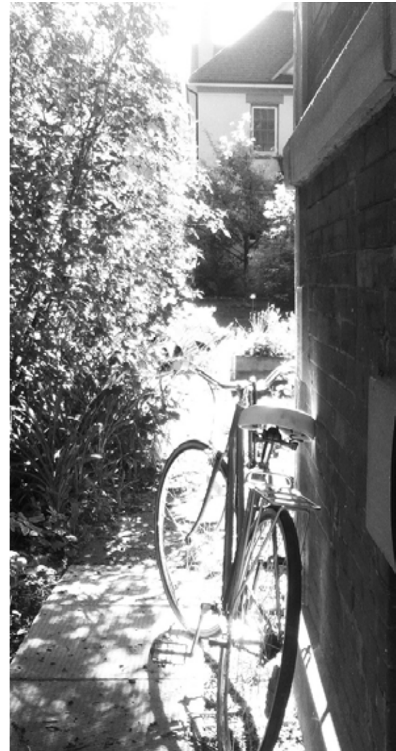
Waiting Bicycle