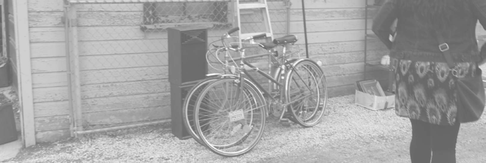
Yard Sale - West Broadway