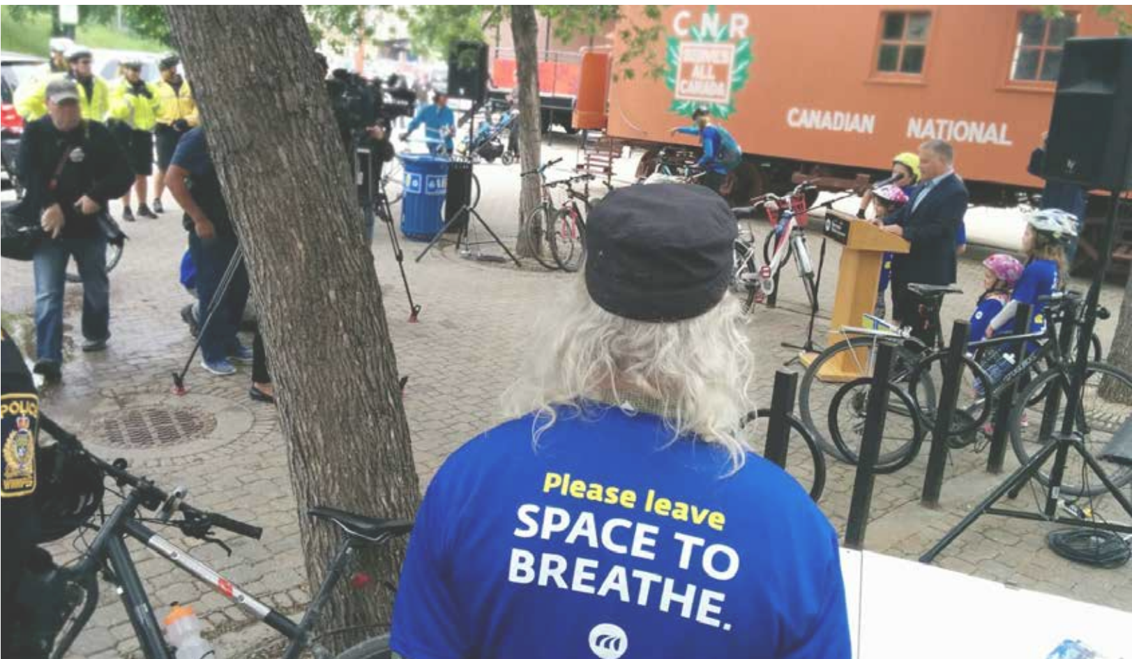
MPI Event: 1 metre campaign, "Leave space to breath"