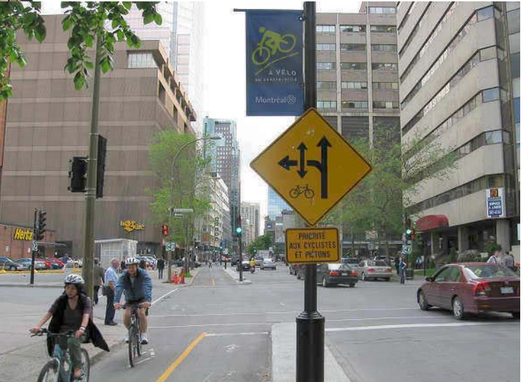
Separated Bike Path Montreal, QC