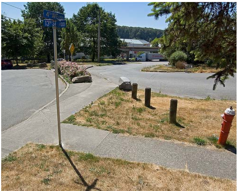
Full diagonal diverter stops through traffic, but allows pedestrians and cyclists to continue