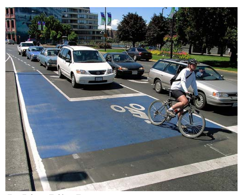
In-Line Bike Box makes left turns easier