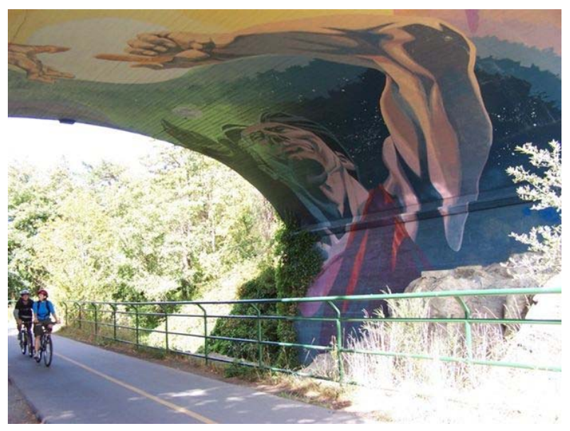
Galloping Goose Trail, Greater Victoria, BC