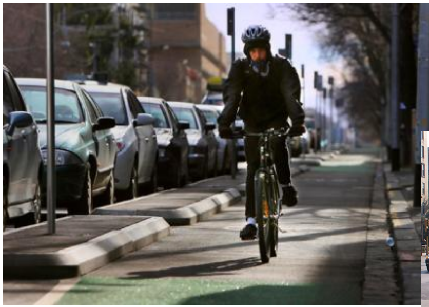
Separated Bike lane next to parking Melbourne, Australia