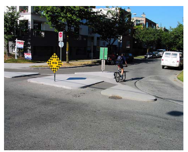
Right turn in, Right turn Out Includes gaps for pedestrians and cyclists

Reducing traffic volume makes a street more comfortable and appealing for cyclists.