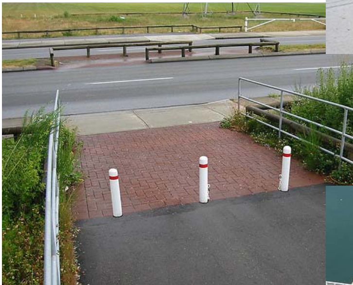
Raised Crossing at yield

Waterfront trial transition to roadway Vancouver, BC