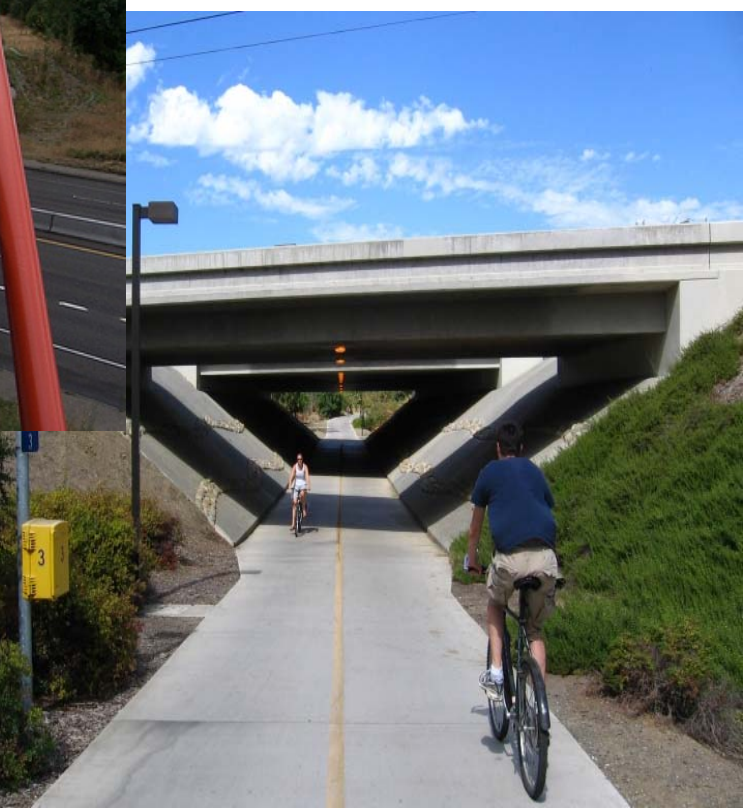
Underpass beneath Arterial Road Davis, California