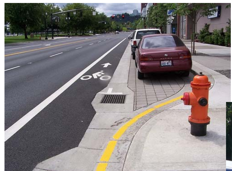
Bike lane next to Parking Naito Parkway, Portland Oregon