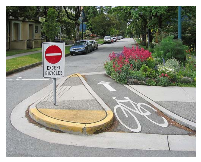
Semi-Diverter prevents through traffic or right turns