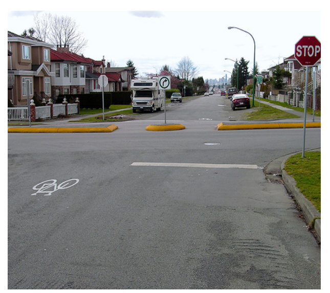
Diverter at crossroads restricts through traffic and left turns