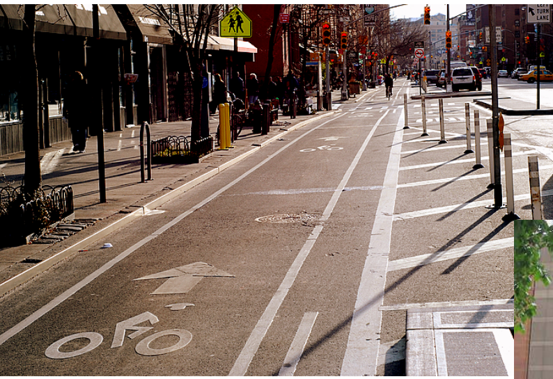
Separated bike lane 9th Avenue, New York New York