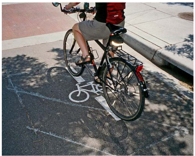
Bike Activated Traffic Signal