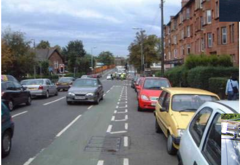
Bike Lane on congested street Finlayson St, Victoria BC

Bike Lane next to Parking Glasgow, Scotland