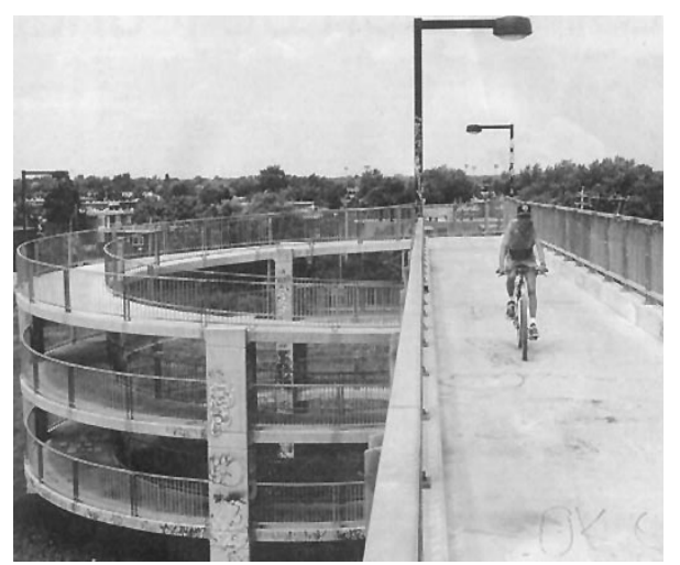
Spiral ramp bridge crosses highway on Route Verte, Quebec