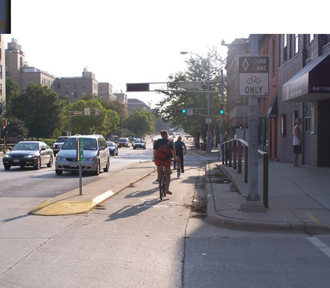
Contra-flow Bike Lane Madison, Wisconsin